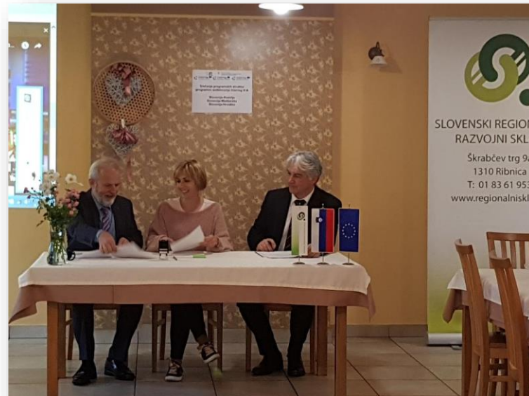
Signed Agreement on mutual cooperation (Ribnica 6 October 2017)