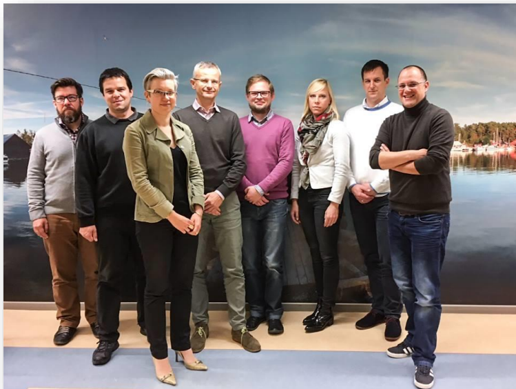
Knowledge exchange with the Central Baltic Programme (9/10 October 2017)